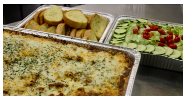
Ask About Our Lasagna Special $100